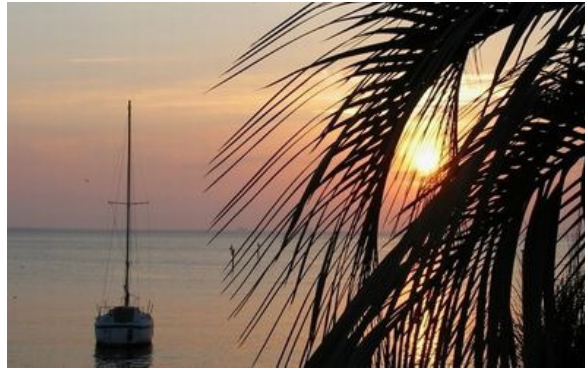
Pensacola Bay, N.W. Florida

A devotional/exhortational essay on the endtime drama.