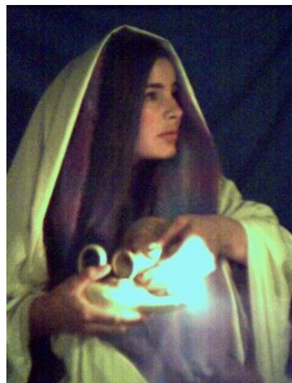
If you would like to use the photo for your webpage or for ministry purposes you are quite welcome to do so. Please click on the image for further info.

"For the which cause I suffer these things, Nevertheless I am not ashamed, For I know whom I have believed, And am persuaded, that He is able, To keep that which I've committed Unto Him against that Day". -1Tim.1:12